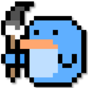
New logo: Enhanced from pen to brush!